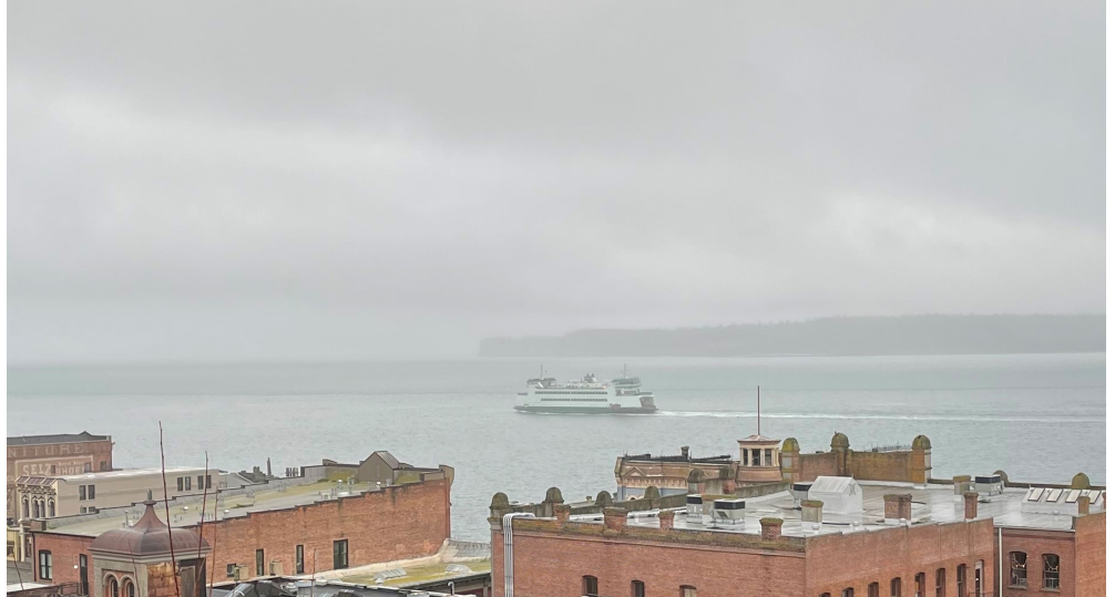
A foggy winter morning in Port Townsend.

Meetings are held at 6 p.m. unless otherwise noticed, and are subject to change. Visit cityofpt.us/calendar for updates.