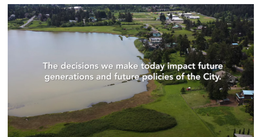
Watch our 2024 General Sewer Plan video, "Investing in Our City Sewer System" on YouTube.

Note that starting January 1, 2024, water rates increased by approximately 2% in accordance with Ordinance 3281 adopted in 2021. This is an annual rate increase. Detailed information about water rates can be found here: cityofpt.us/finance/page/utility-rates .