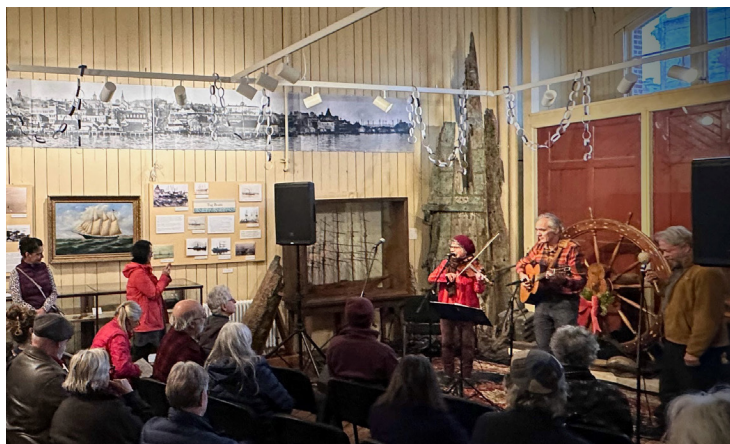
The 2023 Holiday Extravaganza was made possible in part by both grant opportunities, City Lodging Tax, and City Arts Commission.

The Port Townsend Public Library is located at 1220 Lawrence St. Learn more at ptpubliclibrary.org .