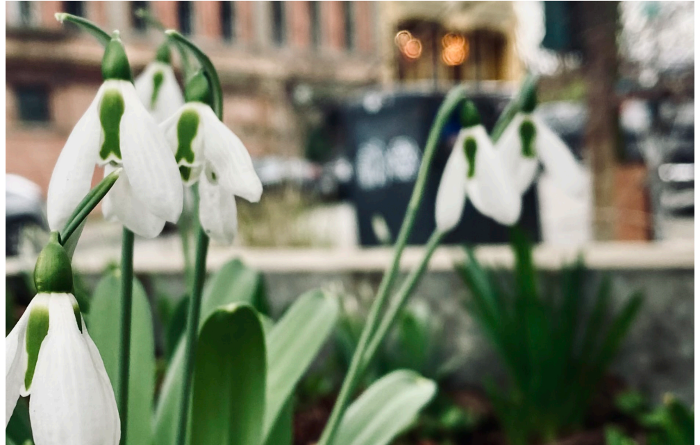
Snowdrops near Haller Fountain, waking up in the midst of a cold winter.

Meetings are held at 6 p.m. unless otherwise noticed, and are subject to change. Visit cityofpt.us/calendar for updates.