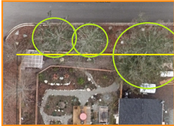
This photo shows private trees in the ROW. Any work to these trees requires a permit

Additionally, sometimes the City will prune or remove trees that pose a hazard. There are also "Public Trees" planted by the City, such as those in grates along Water Street, which the City maintains.