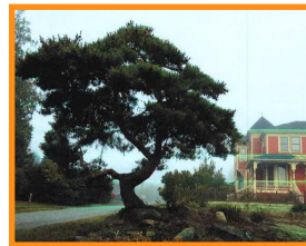
Landmark trees provide generational value