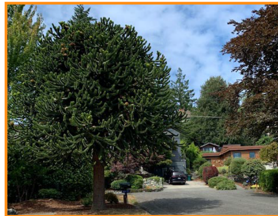
Good example of a tree not impeding sight for vehicles