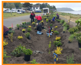
Volunteers planting a raingarden in the ROW

Permits are required for any tree work in the ROW.