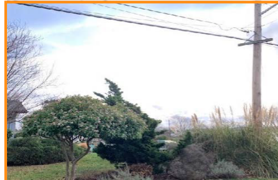
Smaller, short trees are a good fit under power lines