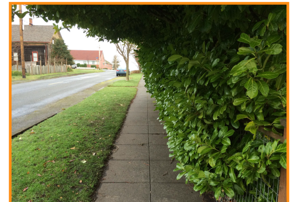
Overgrown bushes block sidewalks