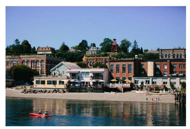
"Waterfront with Kayak"

Given the economic hardships faced by community members and the City overall, we will not ask for additional public operating support during the five years covered by this plan. We will live within our means and work with the City, our Friends and Foundation, and other partners to manage existing resources and leverage creative funding opportunities.