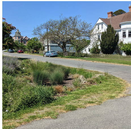
Rain garden with low vegetation allows for clear sight lines at intersection.

A no fee ROW Tree Permit is required to plant, prune, or remove trees in a ROW.